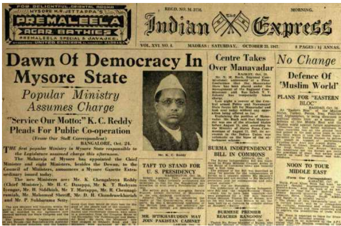
This Day That Year: Here's what made news on October 25, 1947